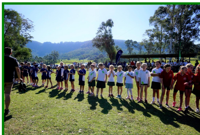
The 8/9 Years girls line up for the first race of the Small Schools Cross Country event. (above)